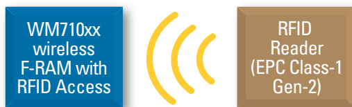
Figure 1: MaxArias wireless memory block diagram

The WM710xx's integrated RFID interface is compliant with the EPC Class-1 Generation-2 UHF Air Interface Protocol Standard at 860 MHz – 960 MHz, Version 1.2.0. The WM710xx is offered in a standard IC package, wafer, bare dice, or as a fully tested ISO-18000-6C compliant transponder antenna inlay (see complete datasheet for full specifications).